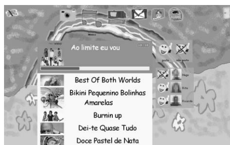
Figure 3: Activity with content preference-sharing pane.