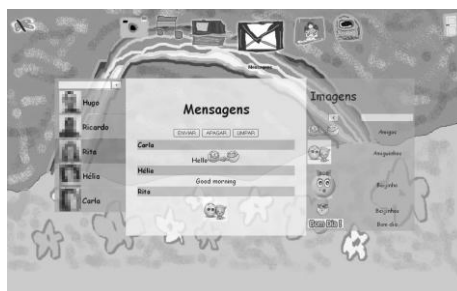
Figure 2: Message board of the application.

there is a positive and a negative preference option. These allow the child to express and share with its counterparts at any time, his/her preference regarding the individual element. This information is associated with the content and shown every time it is accessed, allowing all children to see the opinion of their colleagues. Figure 2 illustrates one of the activities with the content preference-sharing pane on the right area of the screen.