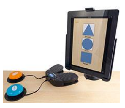
Figure 2 - Blue2 Bluetooth Switch by AbleNet®

One important aspect is that the accessibility features provided by current mobile OS are strictly prepared for single impairments