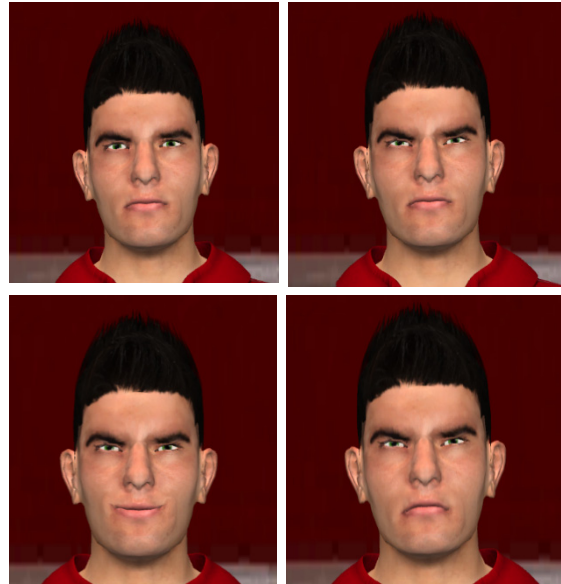
Figure 4: Clockwise from top: a VH with a baseline face (no AUs), displaying a frown (AU4), displaying a combination of AU4 and AU15, displaying a combination of AU4 and AU6+12 (the smile button).

to convey positive affect, more so and more honestly than any other smile. The threatening effect frown is mitigated and possibly the frown is here perceived with other frequent context - attention.