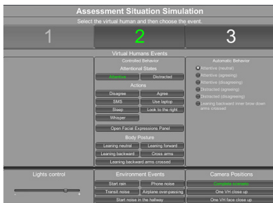
Figure 2: The simulation interface.

To manage interface complexity, the application supports user control of a character at a time, while the others exhibit a pre-defined behavior previously chosen. We call these control modes, interactive mode and automatic mode, respectively. Throughout the simulation the user is free to choose different characters to perform interactive control.