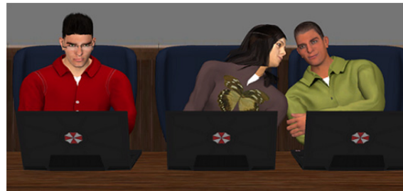
Figure 1: A snapshot of the simulation window.

The application generates a jury simulation with 1-3 VHs capable of exhibiting facial and body expressions controllable in real-time. It displays two windows: one for the simulation and another for the user interface. In the snapshot of the simulation window in Figure 1 all characters are distracted; while one of them uses the laptop, another is whispering to the character sitting beside.