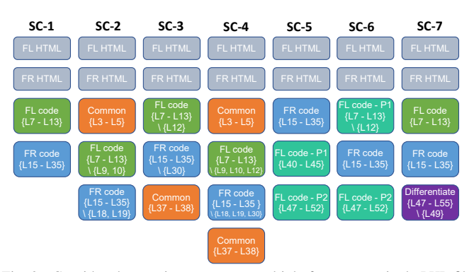
Fig. 2. Considered scenarios to process multiple forms on a single PHP file.

Table I describes each scenario, in the first two columns.